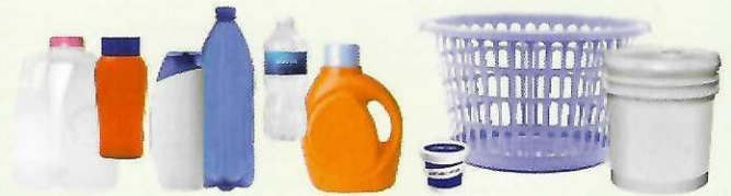
Plastic bottles, Jugs, Laundry Baskets, Yogurt Cups, Kitchen & Laundry containers, 5-Gallon Pails