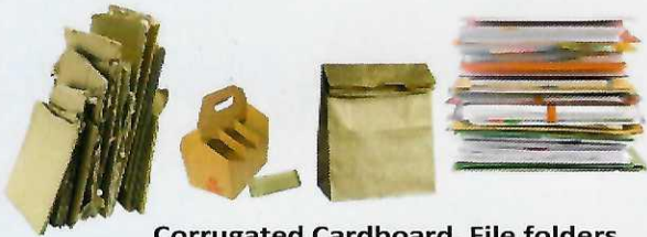
Corrugated Cardboard, File folders office paper, boxes, paper bags & drink holders

For more information, please call 845-753-2200 or visit www.rocklandgreen.com