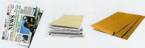
Newspapers & Inserts, Envelopes, Mail Greeting Cards, and Paper of all colors